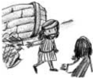
He followed Jesus merily when he heard Jesus' calling.

? Read how Peter, who followed Jesus, lived in the world.