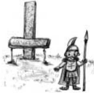
He was crucified upside-down on a cross while He was preaching the gospel.

? Peter followed Jesus at His calling and he did his best to preach the Word of God because he loved Jesus. As Jesus called His disciples, He also called us as His workers in Christ. Draw and write our futures below.