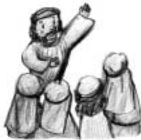
As Jesus had commanded him, he was diligent in preaching the Word of God to the people.